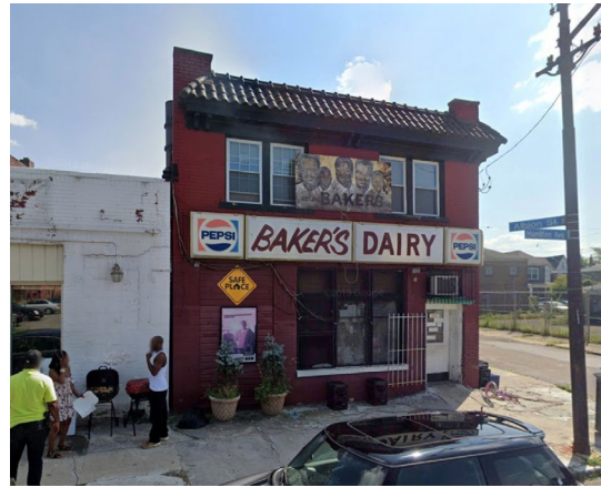
Baker's Dairy in Pittsburgh's Homewood neighborhood

Renovating the “face” of a business means much more than applying a new coat of paint; it requires a holistic approach that takes into account the business’ goals, the building’s history, sustainable strategies, and the unique needs of the surrounding community in order to design facades that are beautiful, safe, cost-effective, energy-efficient, and long-lasting. These services are ever-more urgent in light of the Coronavirus pandemic, when many businesses are forced to change their operations while working with increasingly tight profit margins.