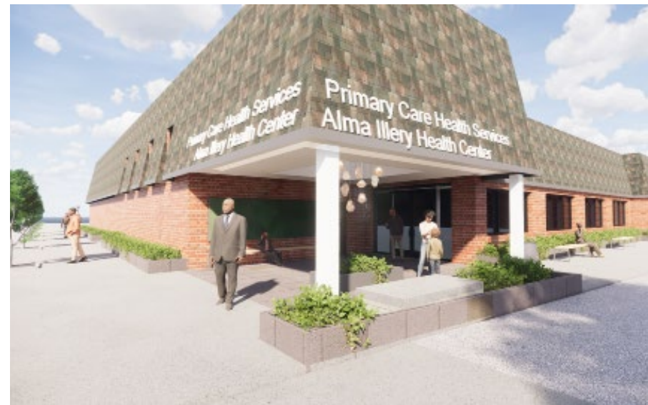
Architect's rendering of design for Alma Illery Health Center's updated facade