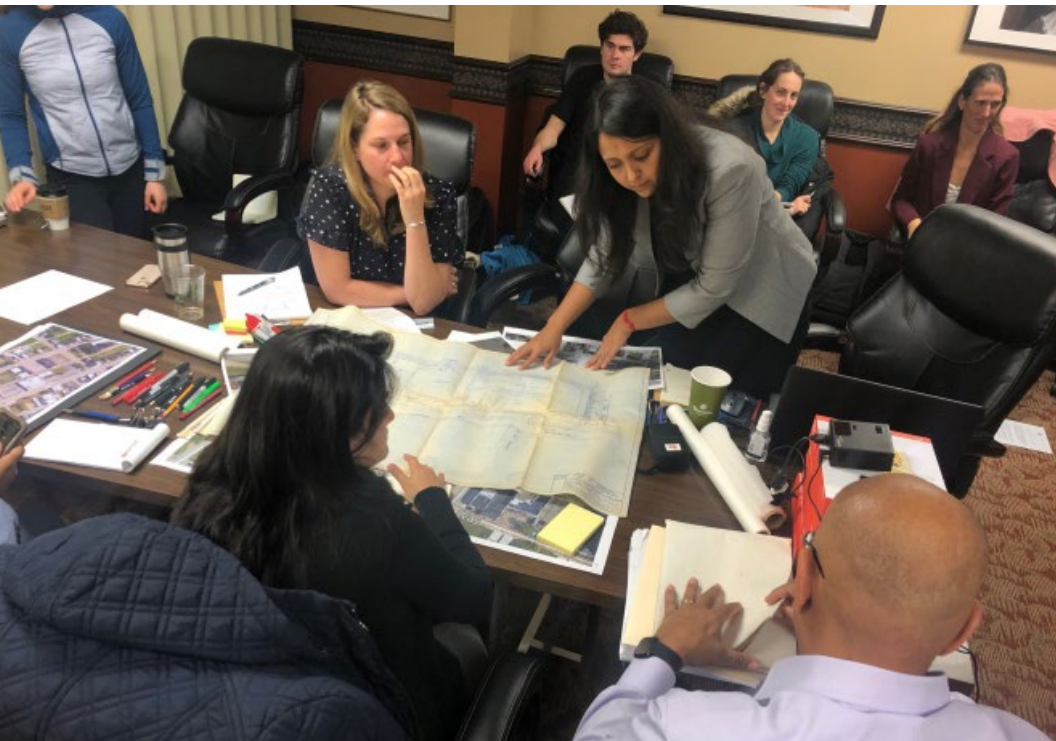
Our volunteer architects collaborate with business owners to create beautiful and feasible facade designs.

Working alongside community leaders to assess the needs of different neighborhoods, the Facade Renovation Program pairs local business owners with teams of volunteer architects who guide them through every step of the process. Each project is jump started with a preliminary charrette—a participatory workshop during which architects collaborate with business owners to develop a concept for their building’s facade. Based on these conversations, PAF’s volunteers work within each business’ predetermined budget to produce drawings and provide design direction. These documents are vital in empowering businesses to seek grant funding, attain permits, and work with construction companies.