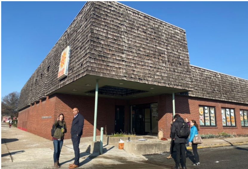
Alma Illery Health Center in Homewood

In Pittsburgh's tight-knit communities, small businesses often serve as the hubs for entire neighborhoods, though many lack the resources to maintain or upgrade their storefronts. To help these businesses thrive, PAF's Facade Renovation Program pairs volunteer architects with small business owners to facilitate a collaborative partnership that makes the rehabilitation process a reality. These collective and collaborative efforts uplift small businesses, revitalize local economies, and elevate Pittsburgh's diverse neighborhoods through access to high-quality design.