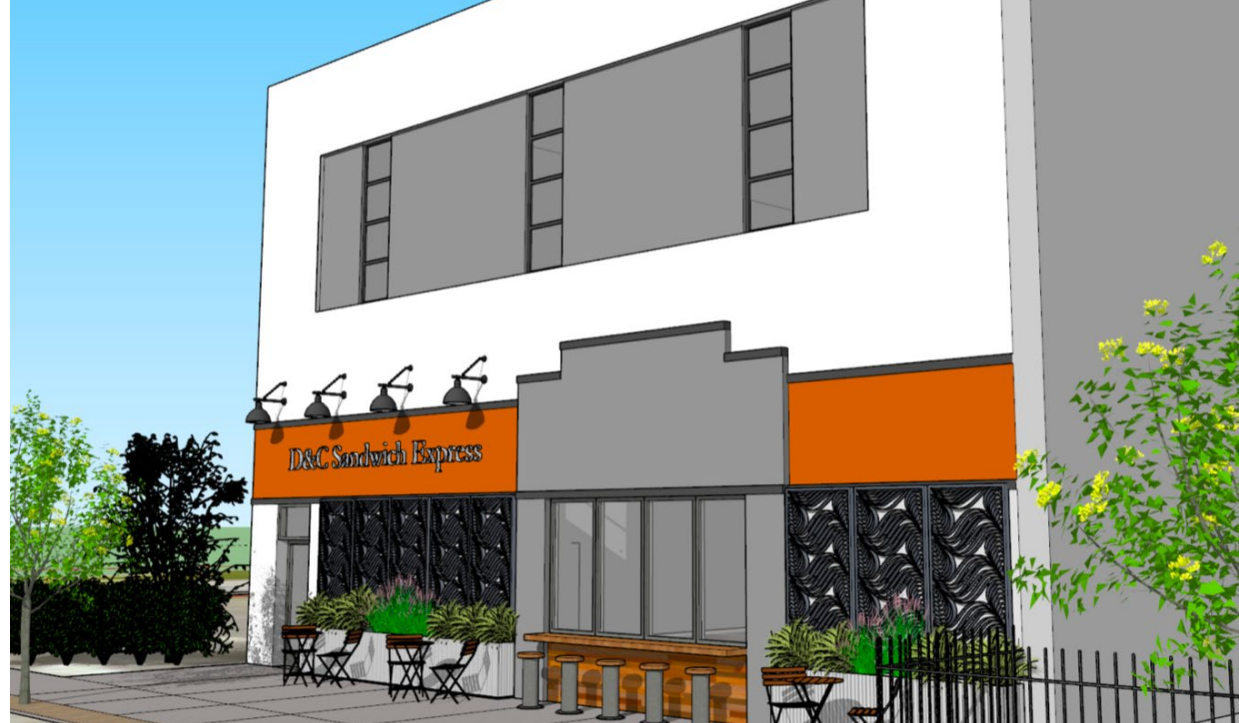
A rendering of D&C Sandwich Express's future facade.